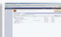
Management Tool (ACM)