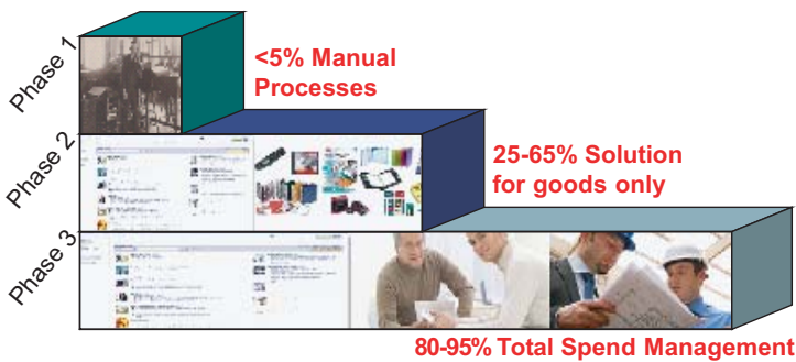
Figure 1: Evolution of Spend Management

Given the current economic climate, companies are faced with several strategies to manage spend and cut costs. Many organizations have already improved their management of direct spend and indirect goods. However, in the area of services, which are notoriously complex to procure, most companies have no visibility into their spend and they cannot manage what they cannot see. Companies need to move towards total spend management in order to quickly deliver the savings required in these difficult times.