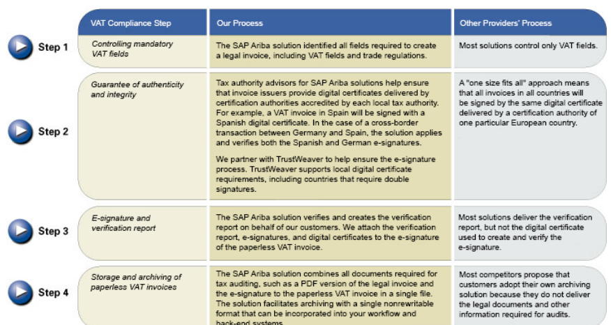
Figure 1: Four Key Steps Required for VAT Compliance

The SAP Ariba e-invoice solution has also been reviewed by multiple leading tax advisory firms in the course of customer-specific audits. The results are consistent: The solution provides the right set of business controls to dramatically reduce a company's compliance risk. As compliance requirements may vary by customer, industry, or other factors, it is important that businesses also confirm templates, rules, and implementation guide recommendations with their own advisors. Our approach to documenting the solution's business controls makes it easy for you to engage advisory services and tailor a configuration that meets your unique requirements or interpretation of compliance.