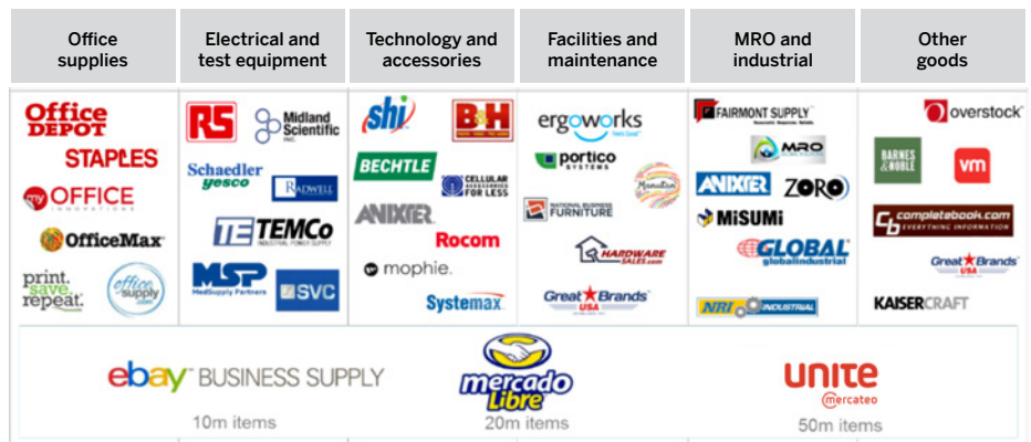
Figure 2: SAP® Ariba® Spot Buy Catalog – Global Supply

Figure 2 shows our three Spot Buy marketplace partners: eBay Business Supply , Mercateo Unite , and Mercado Libre . eBay Business Supply serves North America and Australia. Mercateo Unite serves Europe with a single Spot Buy creditor. Mercado Libre serves Latin America. Together, our partners provide operational savings and easy access to millions of suppliers and items to choose from. You benefit from competitive pricing and the power to rationalize your vendor master file and reduce the growing “long tail” of suppliers.