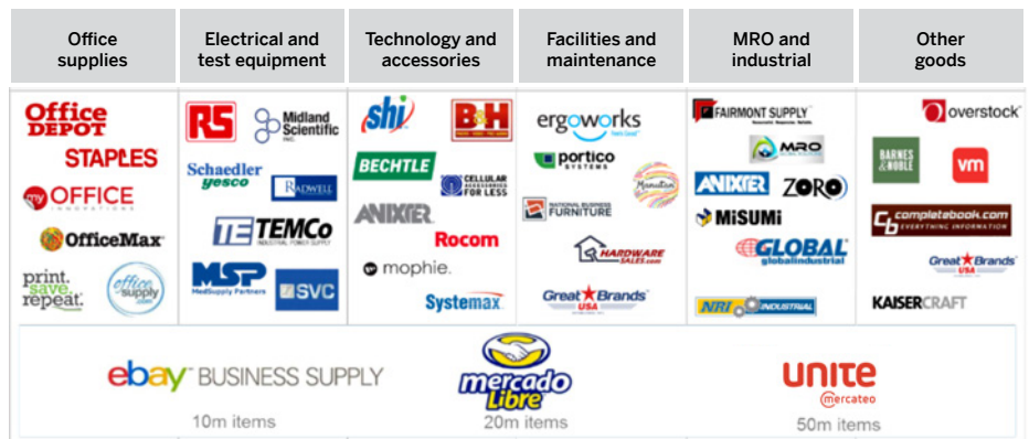
Figure 2: SAP® Ariba® Spot Buy Catalog – Global Supply

Figure 2 shows our three marketplace partners: eBay Business Supply , Mercateo Unite , and Mercado Libre . eBay Business Supply serves North America and Australia. Mercateo Unite serves Europe with a single Spot Buy creditor. Mercado Libre serves Latin America. Together, our partners provide operational savings and easy access to millions of suppliers and items to choose from. You benefit from competitive pricing and the power to rationalize your vendor master file and reduce the growing “long tail” of suppliers.